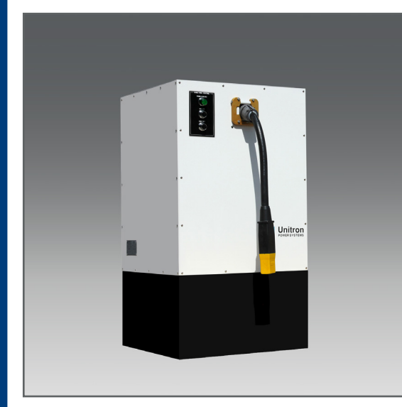
FREE STANDING (shown with optional 18inch mounting stand)

OVERHEAD MOUNT (Shown with unit interface bracket only)