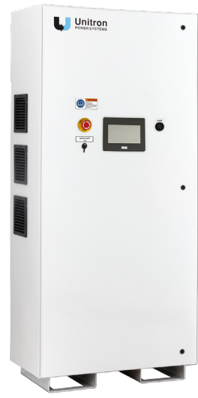
FIXED CONFIGURATION (Shown with standard touch screen front panel)